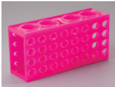
individual rack (5410)